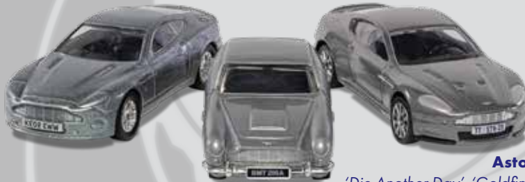
TY99284 Aston Martin Collection 'Die Another Day', 'Goldfinger', & 'Casino Royale' RRP £39.99 Lengths 85mm each | Scale Fit the box

OFFICIAL LICENSED PRODUCT Aston Martin, the Aston Martin Wings logo and the model name "DB5", "DBS", "Vanquish", "V8" are trademarks owned, licensed or used by Aston Martin Lagonda Limited. All rights reserved.