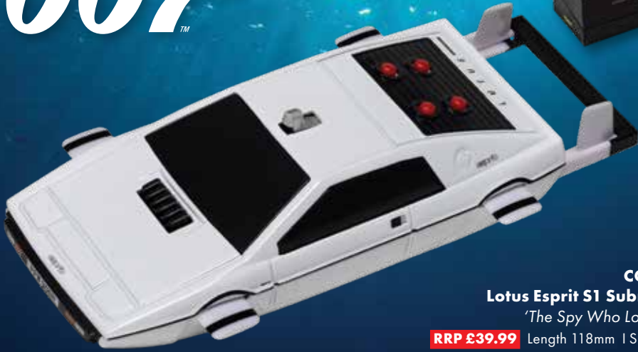
CC04514 Lotus Esprit S1 Submarine 'The Spy Who Loved Me' RRP £39.99 Length 118mm | Scale 1:36

007™ and related James Bond Indicia © 1962-2025 Danjaq, LLC and Metro-Goldwyn-Mayer Studios, Inc. 007™ and related James Bond Trademarks are trademarks of Danjaq, LLC. 2025 © EON Productions Ltd and Danjaq, LLC. All Rights Reserved. 007Store.com