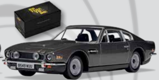
CC04805 Aston Martin V8 Vantage 'No Time To Die' RRP £39.99 Length 131mm | Scale 1:36