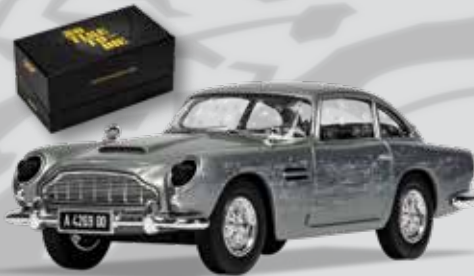
CC04314 Aston Martin DB5 'No Time To Die' RRP £39.99 Length 125mm | Scale 1:36

Produced under license from Group Lotus Plc. LOTUS, the Lotus Roundel, car names and all associated logos and distinctive designs are trade marks of Group Lotus Plc.